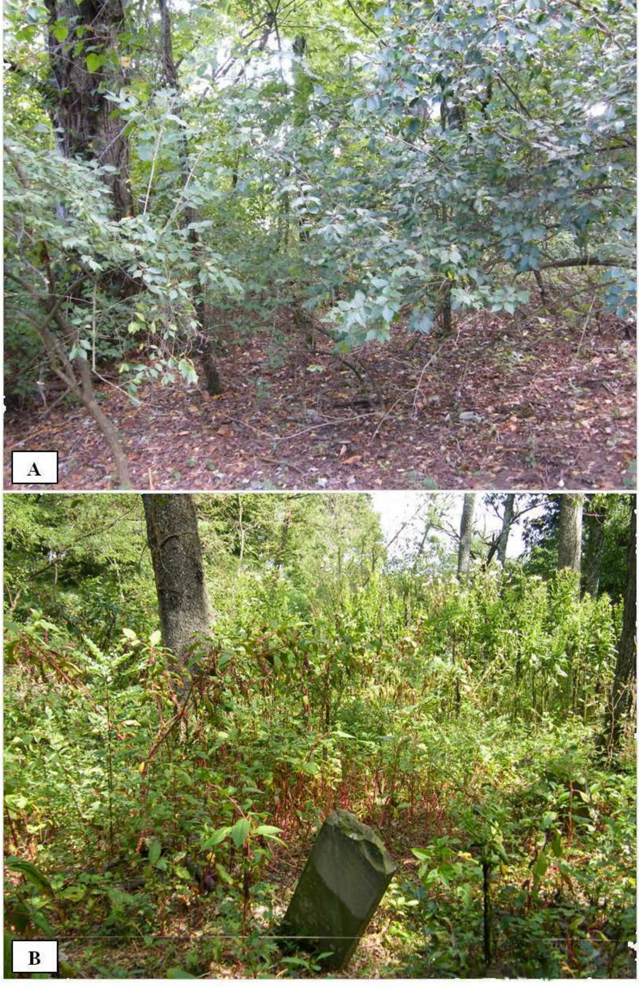
Figure 3. (A) Margin of the Amur Honeysuckle reference macroplot with a scarcity of plants within the herb layer, and (B) margin of the Cemetery test macroplot with a substantial herb layer. Images were taken on September 17, 2011.